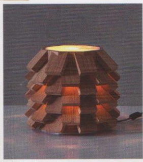
Top: The Palm, a prototype lamp made from ash, oak or walnut with marble, designed by Khalid. Left: A wooden gazelle sculpture from Global Village and collectible books on design and fashion. Right: The Shafar's custom-made dining room seats 24 for large family gatherings